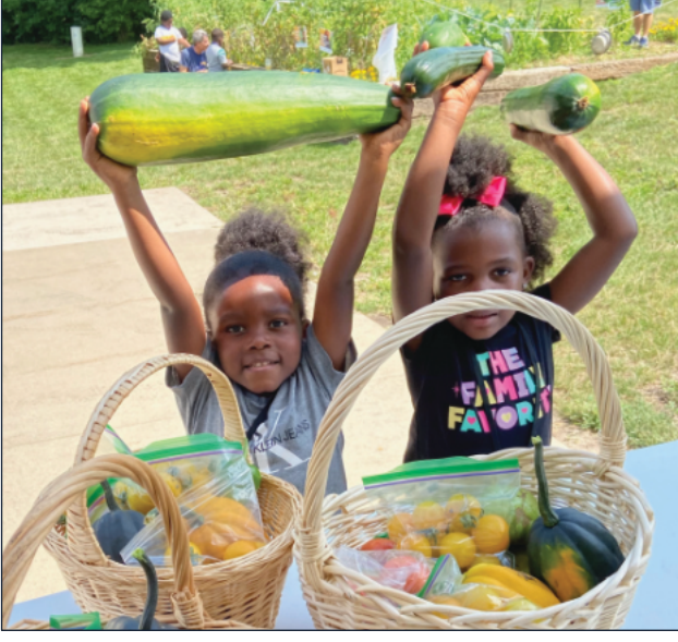
Children show off fresh vegetables and bountiful baskets of tomatoes, squash, beans, lettuce and more after learning about gardening and healthy eating this summer through the Learning Garden.