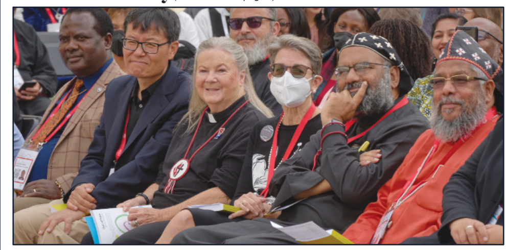
Bishop Sally Dyck (center) joins faith leaders from around the world during the closing prayer service for the World Council of Churches' 11th Assembly in Karlsruhe, Germany.

General Assembly (continued from page 5)