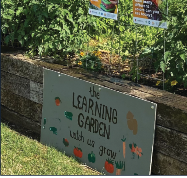
The Learning Garden is a community garden in cooperation with Grace UMC and the Rockford Public Schools and supported by federal dollars to give students social and educational opportunities outside of the pandemic.

The garden comes as a partnership between Maple Park UMC and Root + Branch Church. The garden offers opportunities to enjoy nature, learn about organic gardening and earth care, and nurture new relationships. The garden is also a place where diverse people, of different identities and backgrounds, come together and work toward a common passion for food justice and sustainable living. Organizers said, "we had a marvelous time!"