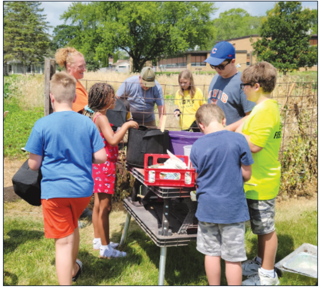
Children plant seeds for a second crop in the garden at Faith UMC in Freeport, which has been growing vegetables for eight years. The vouth and children in Sunday school, the K-8th Wednesday afterschool group and day camp help plant and take care of the gardens and share the produce. The produce is also shared at the block party that the church hosts every year as a kickoff to back to school.