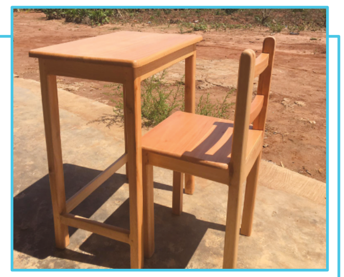
Supporters are making student tables and chairs to fill the classrooms at the Global Mission Secondary School in Tanzania.

The Memorial Service will be available to view online Nov. 12 at 7 p.m. The Retirement Service will be available to view Nov. 14 at 4:30 p.m. Look for a complete wrap up of the session in the December Reporter and the NIC eNews.