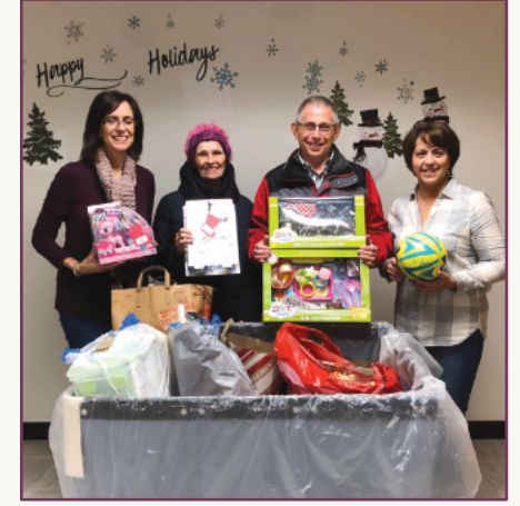
Many United Methodist churches donate gifts to to bring holiday cheer to children through Kids Above All (formerly ChildSery) programs

The NIC Discipleship Taskforce is trying to answer those questions, and help other church leaders do so as well, especially when it comes to youth ministry. For the next six months, they're presenting what they call a "Jumpstarting Youth Ministry" plan. Each month they will have a theme with a video to accompany it, followed by a list of resources to help leaders, both clergy and laity, paid and volunteer, to "jumpstart" their youth ministry, whether it presently exists or whether they're looking for a starting point! Visit umcnic.org/jumpstart to get started.