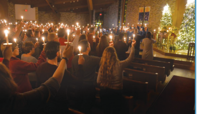
This year's Christmas Eve services in churches will look different than Christmases past but the light of Christ can still be shared.

Some churches are sending instructions in kits on how to make their own Advent wreaths.