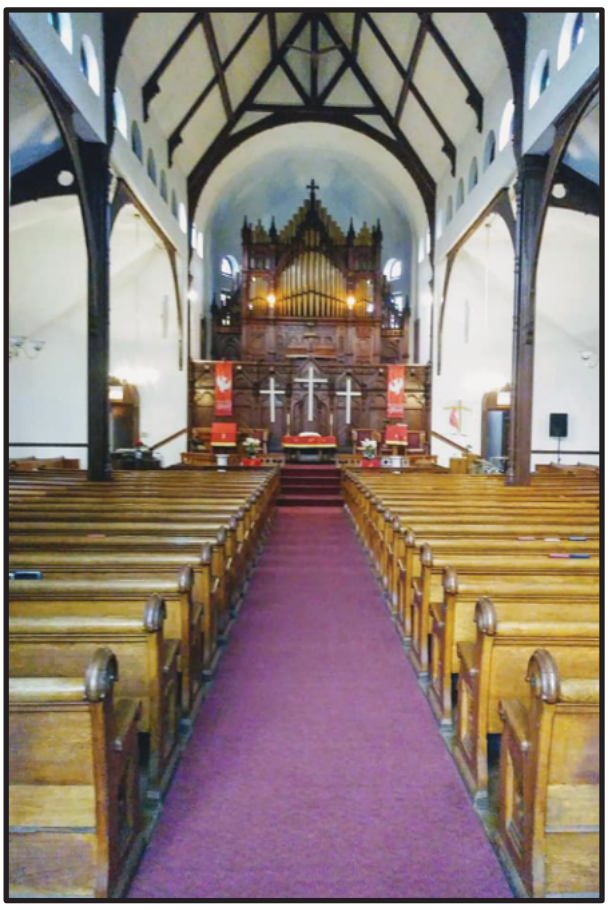
Greenstone's sanctuary has remained unchanged since the 1880s. The cherry wood that comprises the altar and pews, more than 90% of the stained glass windows, and the two manualtracker pipe organ are original to the building.