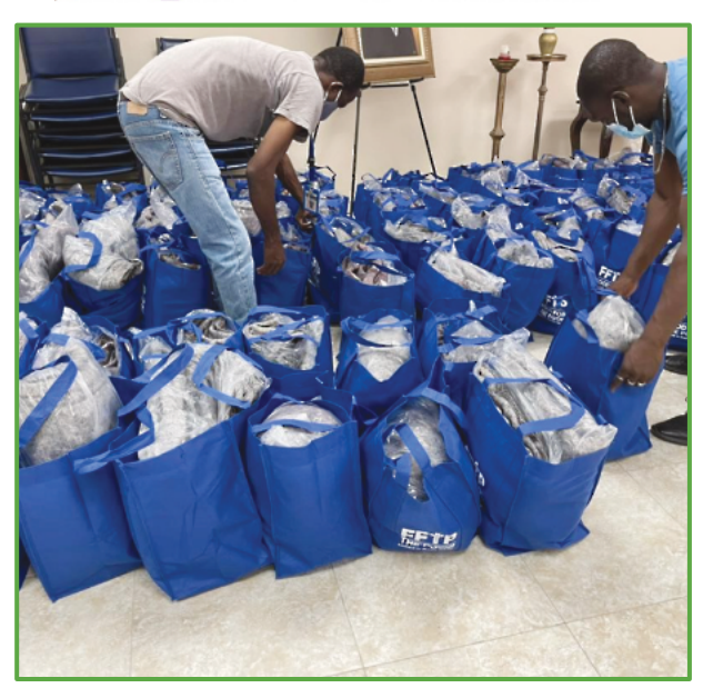
The Midwest Mission Distribution Center works with the nonprofit organization Food for the Poor to distribute disaster relief kits in Haiti.

The NIC Board of Global Ministries is organizing a fall collection drive from Nov. 29 - Dec. 7 to support recovery efforts from the 2021 Hurricanes and the devastating earthquake in Haiti.