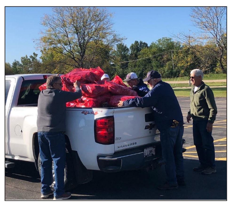
Volunteers unload sacks of potatoes at Grace UMC in Rockford to distribute to food pantries and individuals to combat hunger in the community.