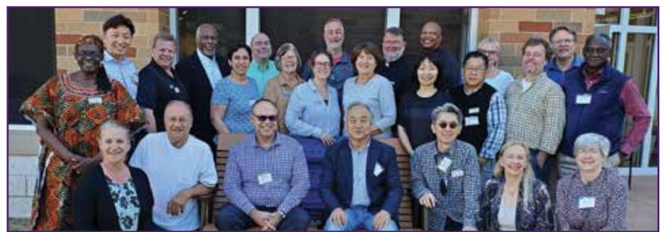
Wisconsin and Northern Illinois task force members met as a group for the first time in Racine, Wis., in September 2023.