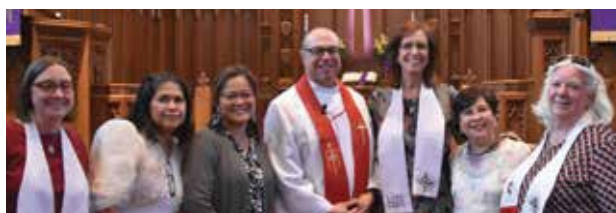
NIC Deaconesses with the Bishop at his February 2023 Installation.

Deaconesses and home missioners dedicate themselves to a lifetime of service to alleviate