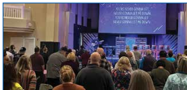
The Fresh Expressions National Gathering included lively worship, workshops, and presentations.

microgrant that helped us to begin a Community Senior Lunch.