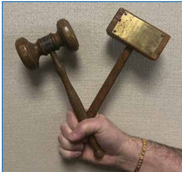
Wood from the original Rock River Conference cabin was carved to make these two gavels, which have been used by NIC bishops.

northern borders of what would become Indiana and Illinois were both set on a line south of the southern shore of Lake Michigan. This line roughly followed the present course of Interstate 80. Were it not for politicking, it would have placed the entirety of the present Northern Illinois Conference in the state of Wisconsin.