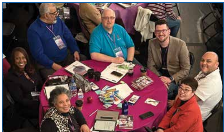
The NIC table at the Fresh Expressions National Gathering.

continued on page 3; see Fresh Expressions