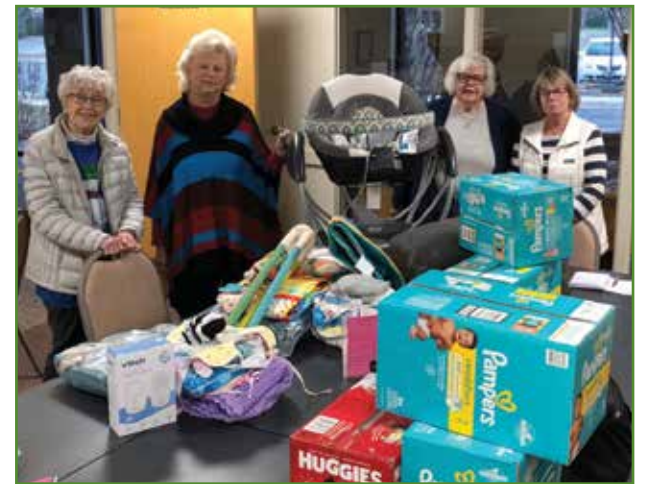
One of the Kingdom Assignment groups with their donations.