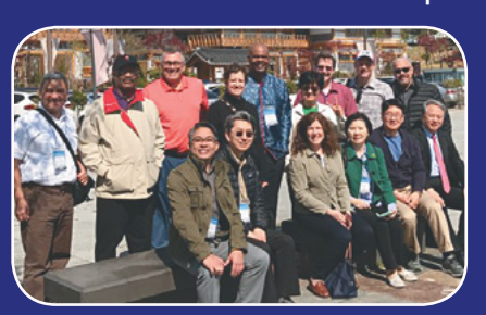
South Korea Immersion | 3