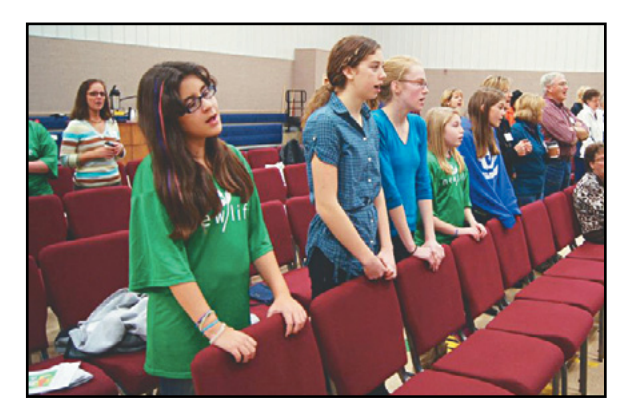
The New Life UM congregation remains dedicated to ministry in the community and will still worship in the former Hilltop Ministry Center which was purchased by Easterseals.

On that land where crops were once harvested, people's lives will continue to be touched and changed and made new through the ongoing ministry of New Life and through the loving work of Easterseals. And that original farm homestead includes 10 acres that the NIC has for future ministry needs. Thanks be to God for new possibilities!