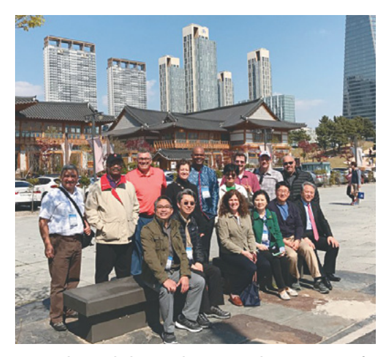
14 people traveled to South Korea April 19-27 as part of the 2017 Vital Church Immersion Experience organized by the Northern Illinois Conference's Institute for Congregational Development. The group rose every morning at 5 a.m. for prayer services and visited the Demilitarized Zone (DMZ) to pray for peace.

There have been too few times in my life where I have felt overwhelmed by God's love. I've rarely doubted God's love for me, but it's always felt like it was just enough. But that's more my issue than God's. The kindness after kindness shown by us by the members of Bupyeong reminded me that God's love is never just enough. As First Timothy reminds me, God's grace overflows. It spills over. It, frankly, can make a mess, which can make me feel uncomfortable. I confess to wanting that love meted out just so. But the hospitality of Bupyeong reminded me that it's OK to receive the overflow and grab a cup to receive even more so that, as Paul notes in Philippians 1:9, my love for God and neighbor might overflow more and more.