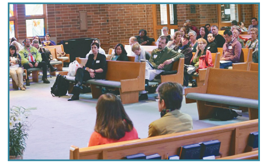
Nearly 120 people from across the Northern Illinois Conference attended a day-long event to share stories and connect around immigration issues.

For more info on NIJFON visit: www.nijfon.org and for a list of other resources provided at the event, including what The United Methodist Church says about immigration, facts and figures and tool-kits for churches, go to: www.umcnic.org/immigrationresources.