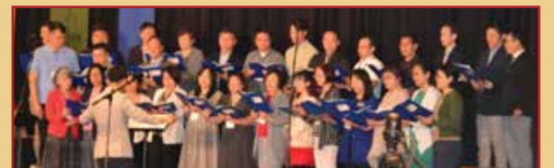
Korean Clergy Choir performed at the Retirement Recognition Service.

Watch a video of the Retirement Recognition here: vimeo.com/966996283 .