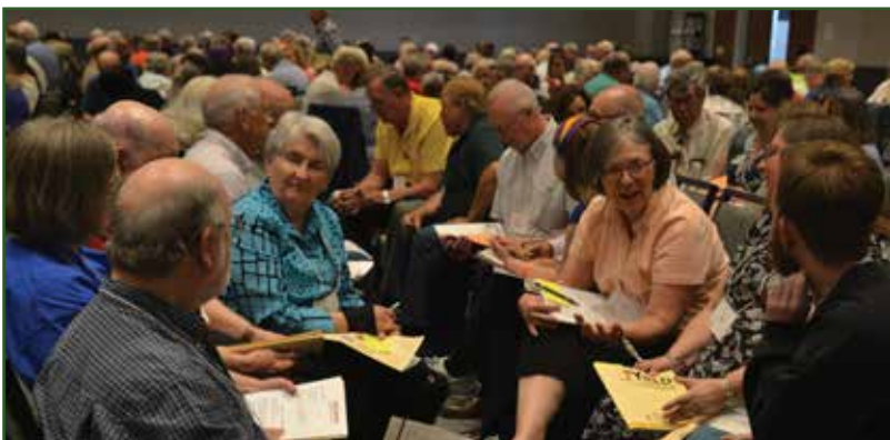
Laypeople discuss their questions about what's ahead for the NIC.