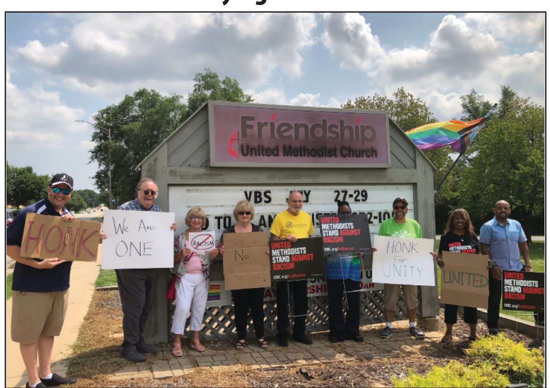
Members at Friendship UMC in Bolingbook hold a rally against racism in the summer of 2021 for the inaugural Northern Illinois Conference DIY Rally Against Racism campaign.

Last summer, the NIC Annual Conference Shepherding Team (ACST) and the Anti-racism Task Force (ARTF) joined together to spearhead a way for churches to visibly show their commitment to the goal "to live out the conviction that racism is incompatible with Christian teaching."