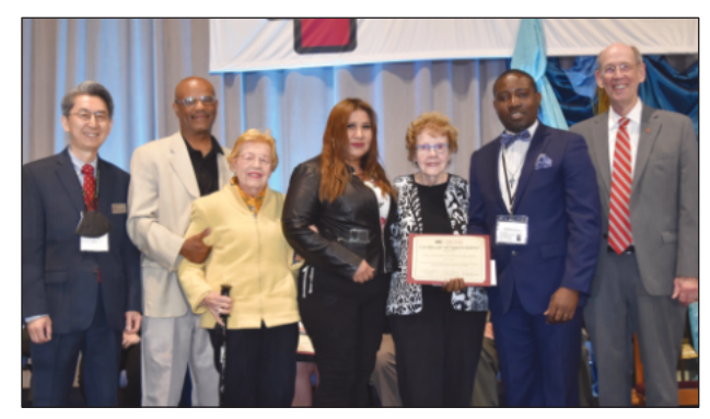
Members of Grace UMC in Blue Island accept the One Matters Award at the 2022 Northern Illinois Annual Conference.