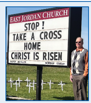
3 Church Crosses Support Ukraine