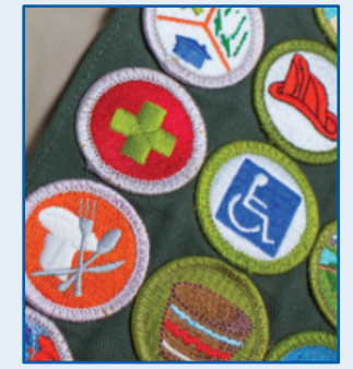
6 Planning Future of Boy Scouts

Non Profit Org U.S. Postage PAID Permit #130 Homewood, IL.