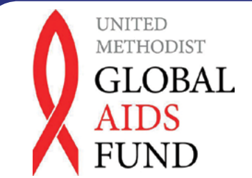
Global AIDS Fund | 4