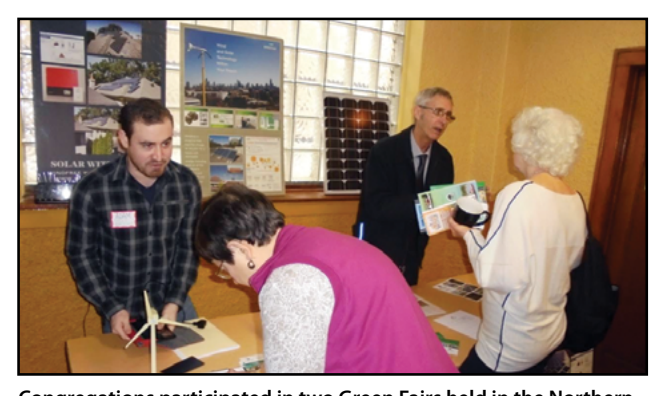
Congregations participated in two Green Fairs held in the Northern Illinois Conference in February and March to learn ways to sustain the Earth.