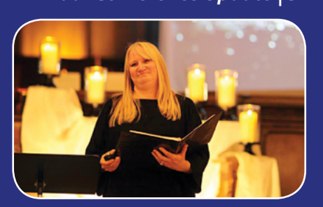
Worship Leader | 3