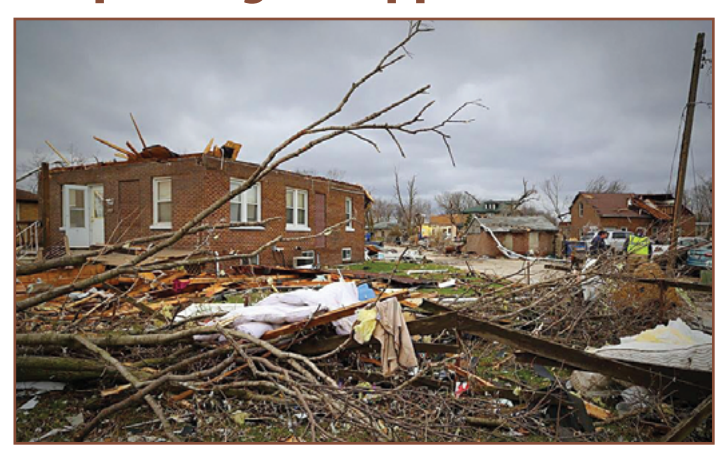
Several EF3 tornadoes left a trail of destruction through north-central Illinois on Feb. 28.

When an EF3 tornado barreled through the small communities of Ottawa and Naplate in north-central Illinois on Feb. 28, there was an immediate response to help from United Methodists.