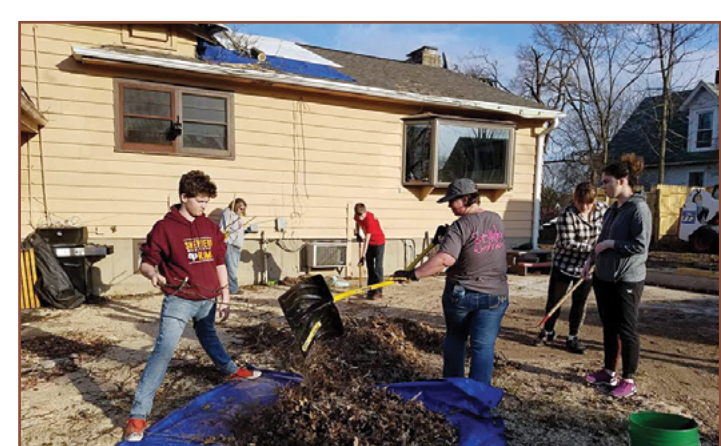
Youth and adult volunteers from First UMC in Ottawa grab rakes and garbage bags to clean up yards of downed trees and debris.

She said the night of the tornado youth from Ottawa FUMC sent her texts asking 'how they could help'. The next morning