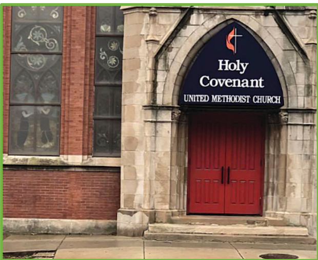
Holy Covenant reported items from several packages meant for its feeding program were stolen off the front steps of the church on Feb. 9.

A thief may have stolen packages from the front steps of Holy Covenant UMC in Chicago, but that didn't stop the church's ministry of helping feed the homeless.