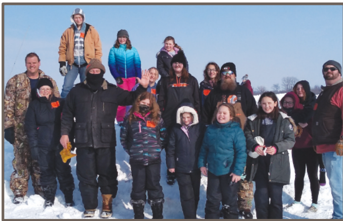
Youth from Warren and Elizabeth UMC enjoyed some winter fun sledding as a “thank you” for their volunteerism the past year.