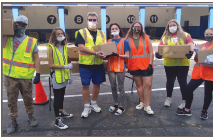
The church youth group helped with several ministries including working at the Rockford and Galena food distribution centers.