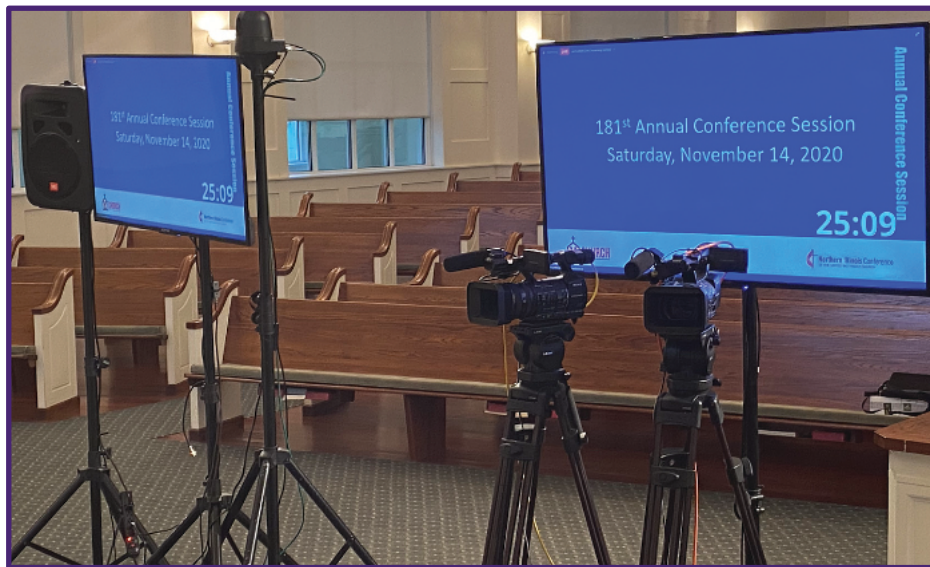
The 182nd Annual Conference scheduled for July 16-17, 2021, will look similar to last year’s first-ever virtual annual conference held November 2020 and will be held through a Zoom webinar.

“It is our hope that the improvements we are seeing in COVID-19 infection rates will hold and that we can conduct this service