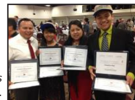
Members of the Latina/Latino Academy receive certificates which also allow them to serve in local churches.

This area is composed of Church Development and Redevelopment and also supports New Faith communities. It also supports the Institute for Congregational Development (ICD) and Latina/Latino Academy.