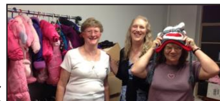
Program Ministry funds support Creative Ministry grants, such as the coat ministry of Grace UMC in Dixon, IL.

The Program area comprises all of the committees and boards of the NIC (about 60). It is represented by the Nurture, Outreach, and Witness & Advocacy work areas. Each committee in these work areas represents a touch-point for the Conference to impact your congregation or individual lives in your community. The Program Area gives an opportunity for leaders to develop and share their skills beyond one local church and serve the whole Annual Conference.