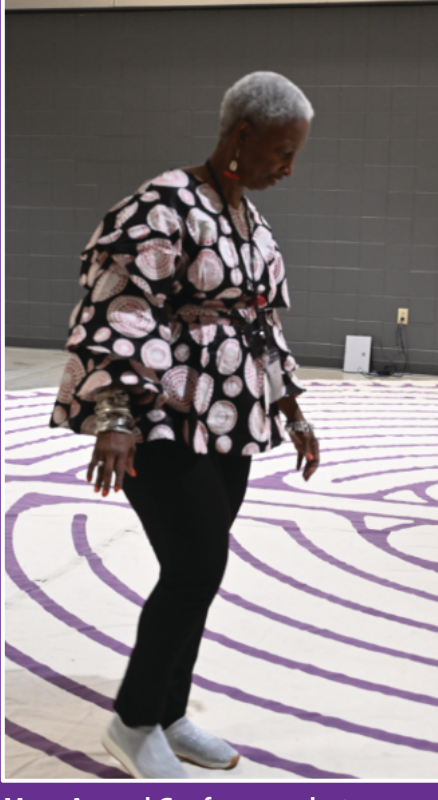
More Annual Conference photos on page 2 and throughout the issue.