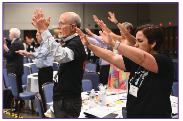
Annual Conference members participating in the tong sung prayer, joining their prayers with others for a peace agreement in Korea

It was like a scene out of Acts 2: A diverse group of a few hundred people, with skin colors ranging from brown to ivory and speaking with varying accents, stood facing the same wall in a suburban Chicago convention center, arms outstretched, praying loudly in their native tongues for peace on the Korean