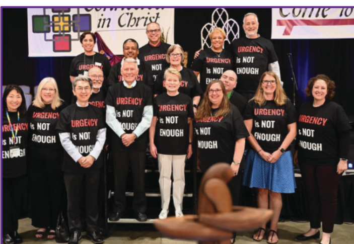
Members of the Annual Conference Shepherding Team model the "Urgency is Not Enough" shirts that were provided to all conference attendees.

To watch a video of the Annual Conference Shepherding Team report, visit vimeo.com/836912920.