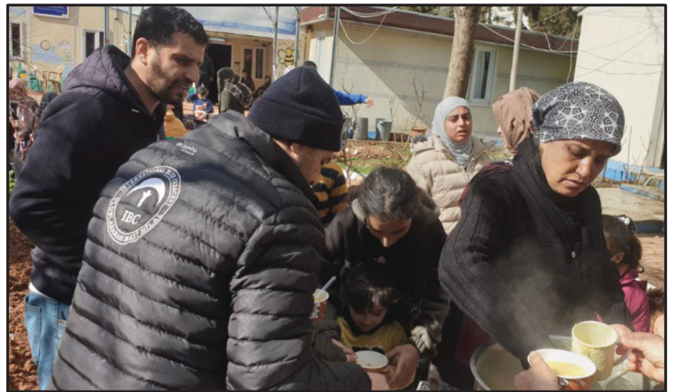
IBC staff serve meals to earthquake victims at Kilis Community Center.