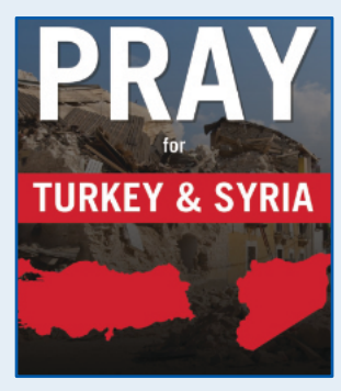
6 UMCOR Earthquake Response