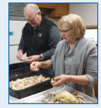
4 Church tradition continues 5 Thankful for giving after merger