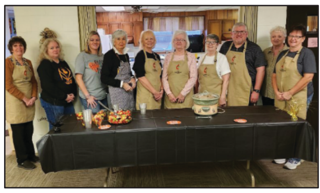
Ashton UMC volunteers ready to feed the student athletes.