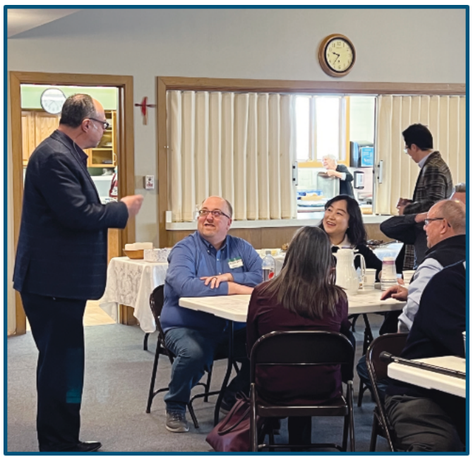
Clergy fellowshipping in Prairie North at Christ UMC in Rockford, IL.